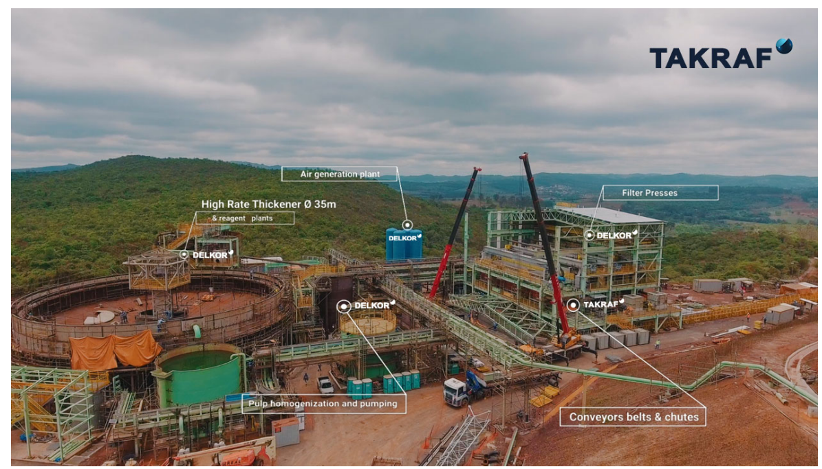
DST system under construction for the safe and effective handling of iron ore process tailings recently supplied by TAKRAF Brazil to Mineração Usiminas.

As tailings processing is complex, a detailed understanding of and expertise in the different steps specific to the commodity and project location are required. All equipment needs to be designed and/or adapted to specific project requirements and to be integrated seamlessly into the overall system. As a result, TAKRAF adopts a comprehensive and holistic approach to the design of its DST systems, combining its proven expertise in dewatering (DELKOR) and materials handling (TAKRAF)