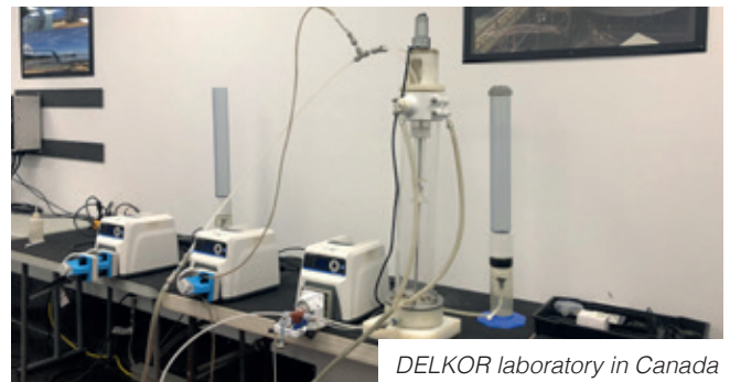
DELKOR laboratory in Canada

DELKOR's dedicated aftersales team monitor the performance of installed equipment and conduct regular health checks on site. Where necessary, they will provide suitable suggestions for part replacement for refresh and/or rectification, resulting in improved machine performance. The service team is available 24/7, providing a timely and reliable service for installed equipment, ensuring faster rectification/service, ensuring that your system is back in operation as quickly as possible!