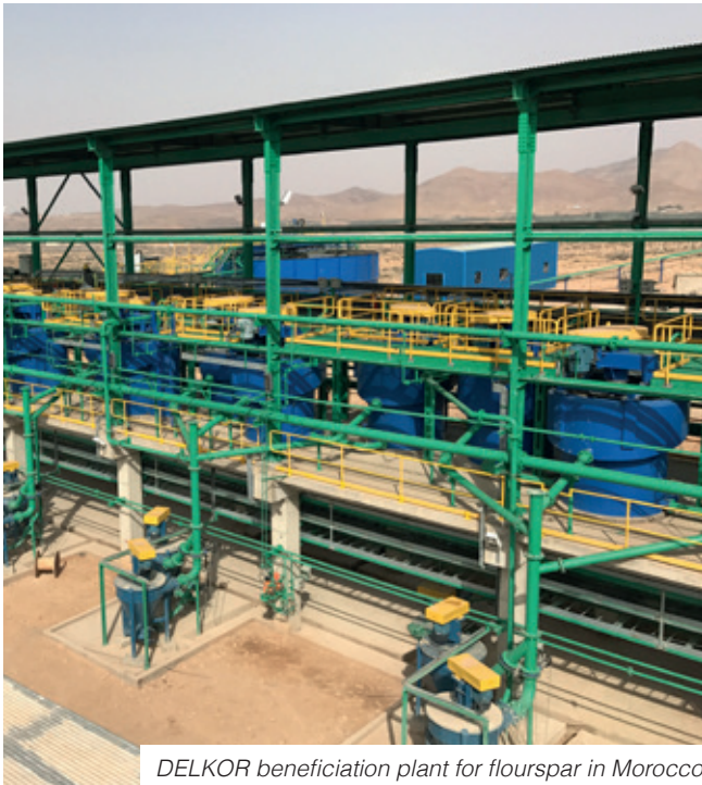
DELKOR beneficiation plant for flourspar in Morocco