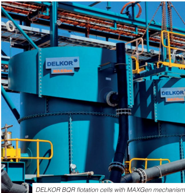
DELKOR BQR flotation cells with MAXGen mechanism

The MAXGen mechanism focuses on the generation of a swarm of air bubbles with optimum size distribution, which facilitates the flotation of fine and coarse particles equally, while efficiently keeping the solids in suspension. This maximizes the probability of bubble-particle interaction and leads to greater recovery of valuables and energy efficient hydrodynamics.