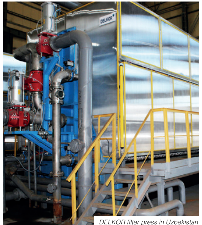
DELKOR filter press in Uzbekistan

DELKOR filter presses boast a heavy-duty design and each machine is customized to the specific process requirement and as such are specifically designed to handle the rigors of the mining industry.