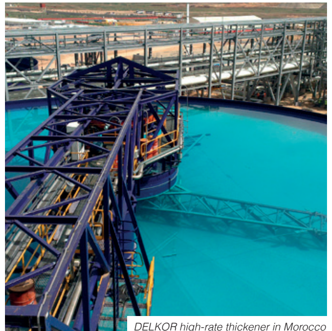
DELKOR high-rate thickener in Morocco