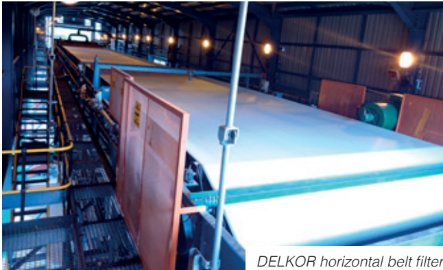
DELKOR horizontal belt filter

Dewatered tailings can either be used as mine backfill or sent straight to the Dry Stack Tailings (DST) impoundment. This results in a technically viable and economically feasible solution to handle process plant tailings in the safest and most environmentally friendly manner. DELKOR filters can be employed as stand-alone machines or in combination with other filtration processes.