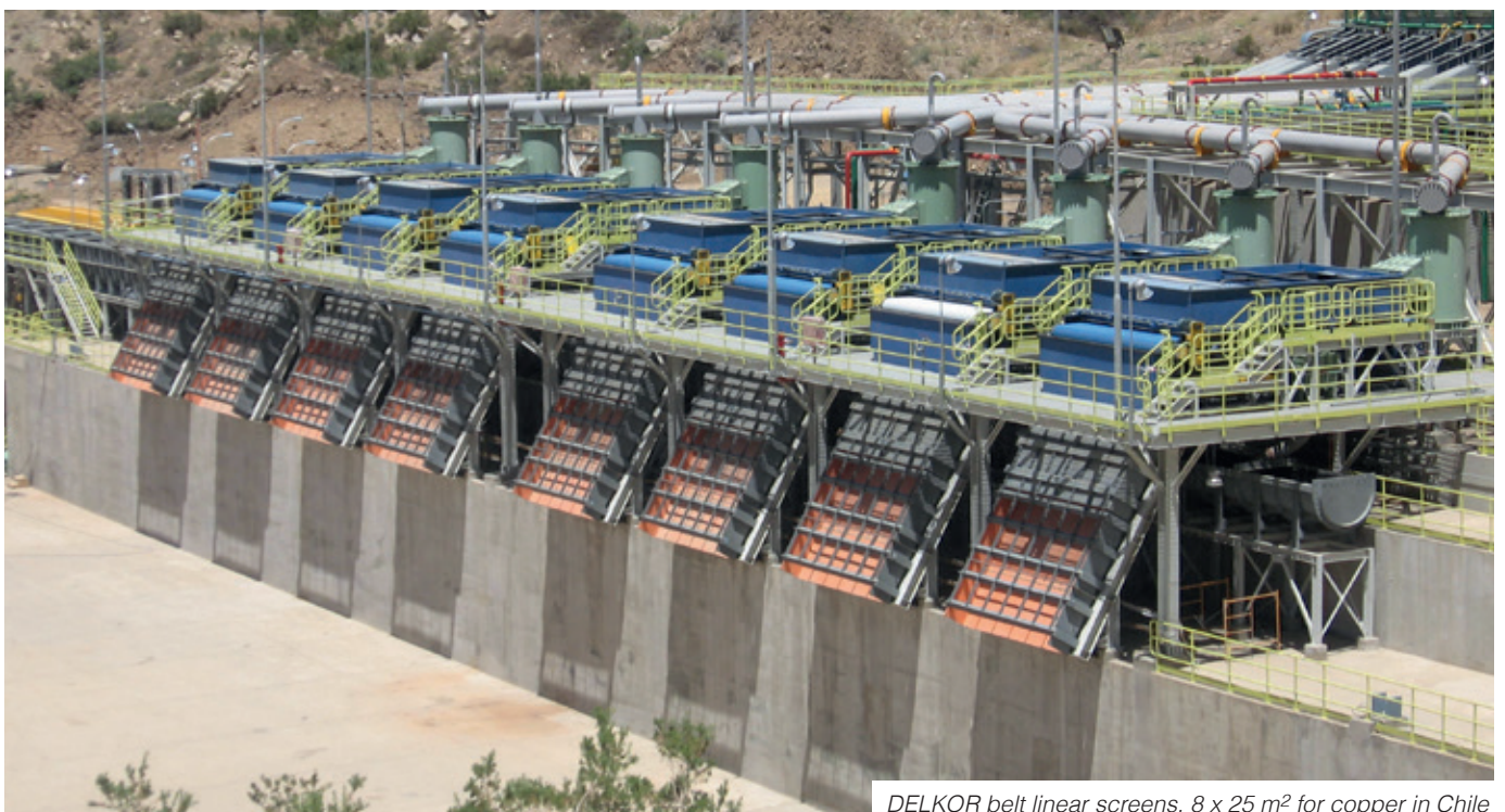
DELKOR belt linear screens, 8 x 25 m 2 for copper in Chile

Safety | Reliability | Innovation | Sustainability