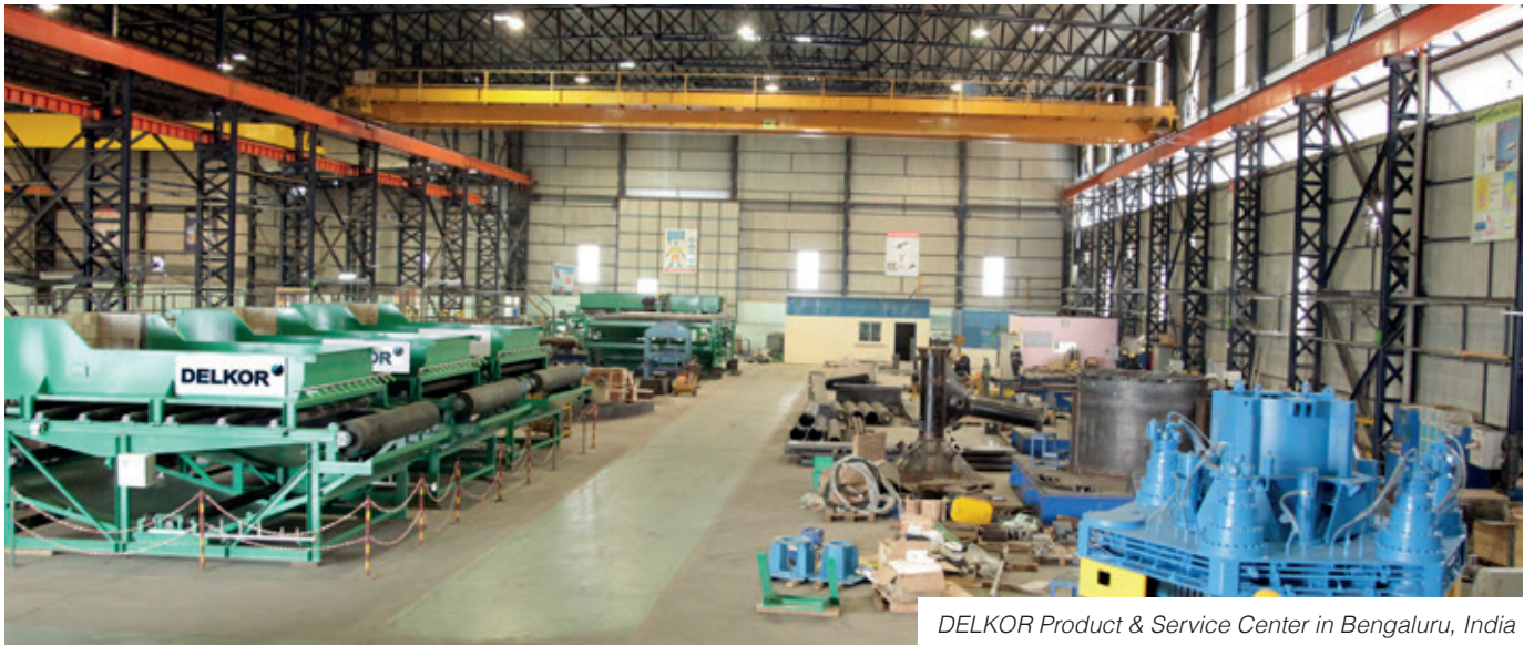
DELKOR Product & Service Center in Bengaluru, India